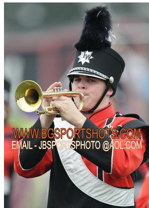
The effort of the Hamilton football team today made it a lot easier to cheer (above) and allowed the band to blow some winning notes.