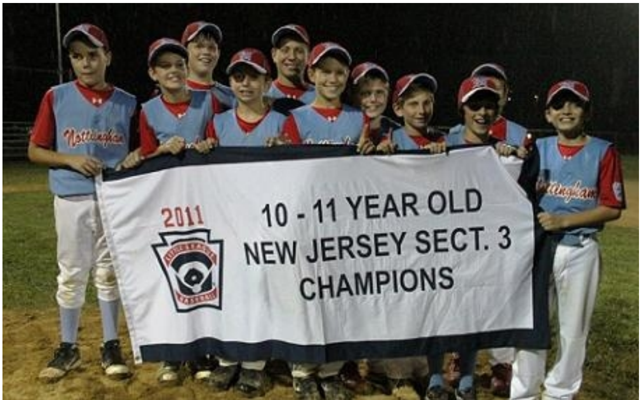
First they had the celebration (above) and then they showed off what they were celebrating as the Nottingham LL 11-year-old All-Stars beat North Wall for the second straight night to claim the NJ Little League Section 3 championship at 6-11 tonight.